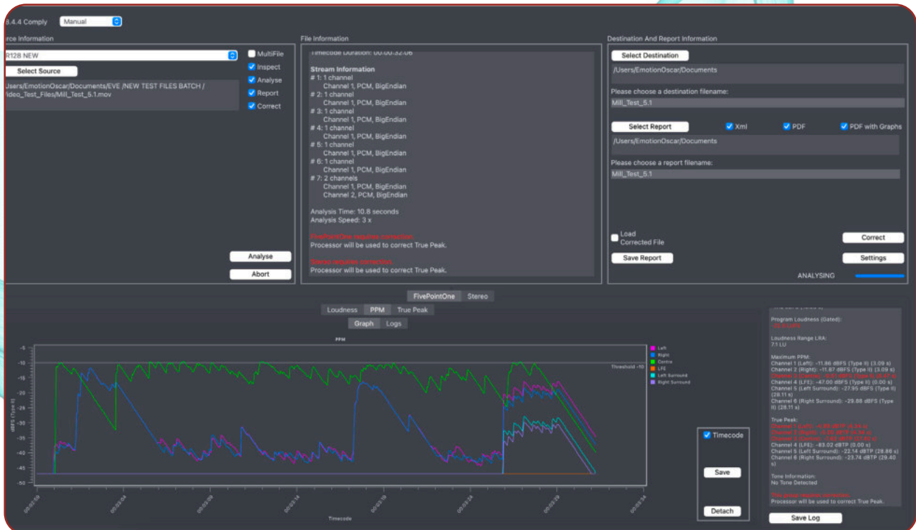
Clear and simple UI enables easy configuration

Windows 10/11, Server 2016/2019/2022. Mac OSX 10.8 onwards.